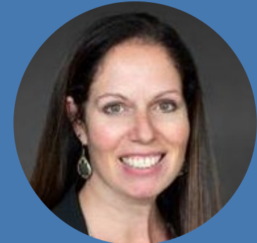
Commissioner Darcie L. Houck