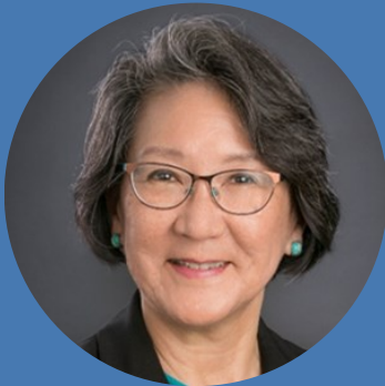
Commissioner Genevieve Shiroma