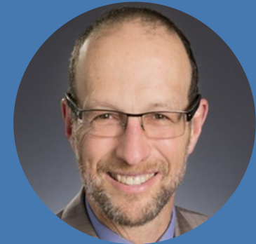
Commissioner Clifford Rechtschaffen