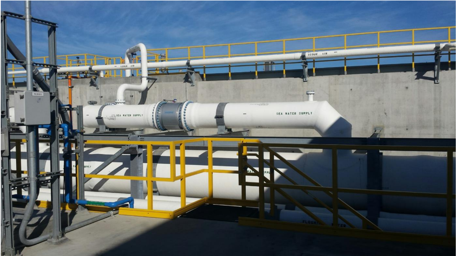
Poseidon Desal Sea Water Supply