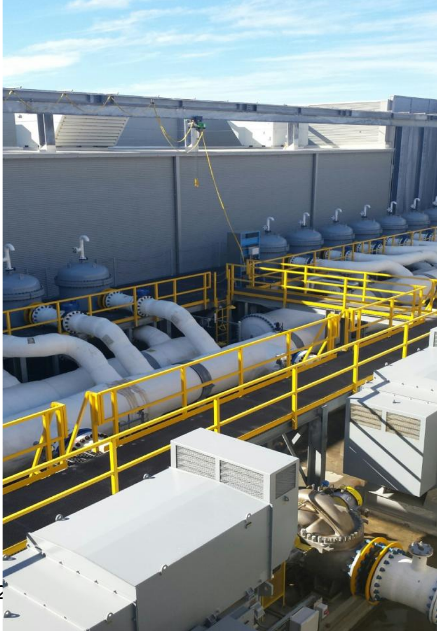
Poseidon Desal Plant Tour