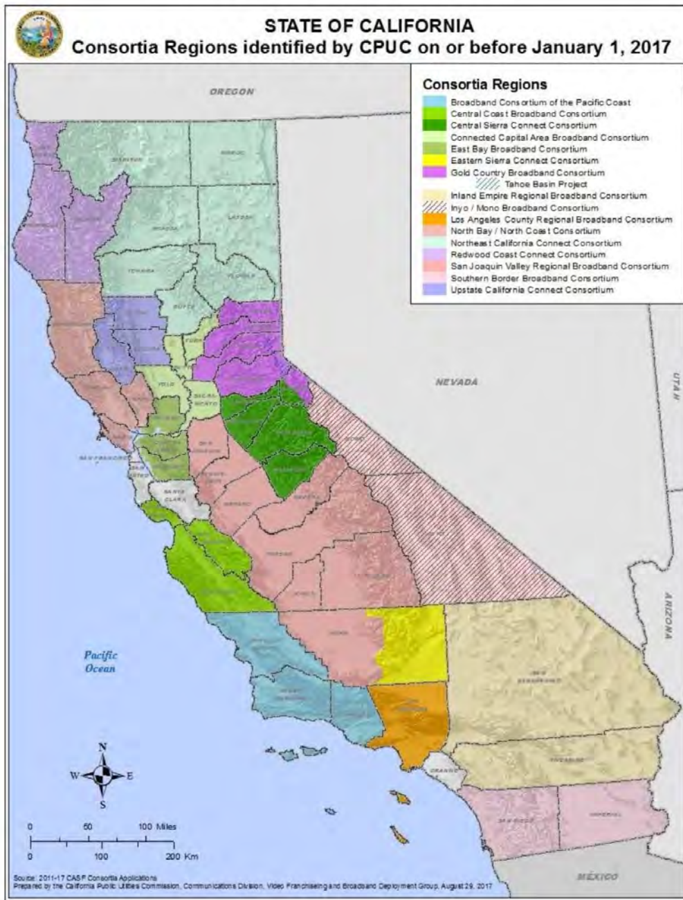
Map 3: Approved CASF Consortia (Updated 2018)