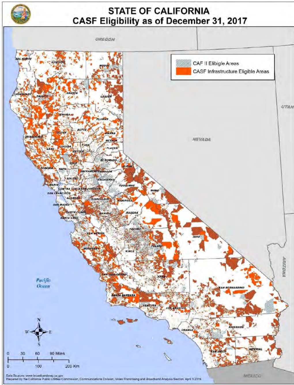
Map 7: CASF Program Eligible and CAF II Location Areas