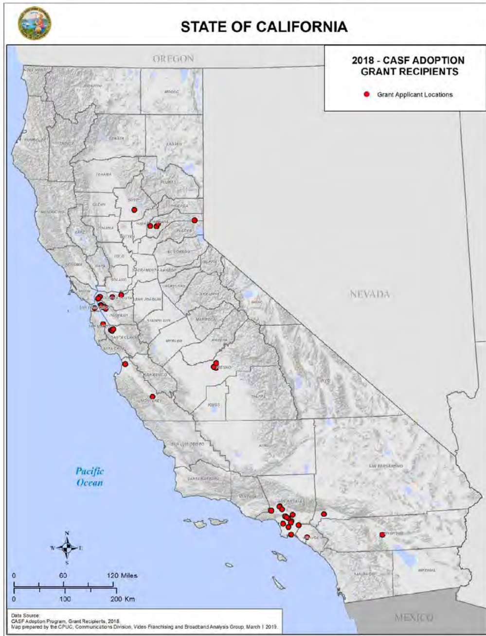
Map 5: Location of Adoption Projects