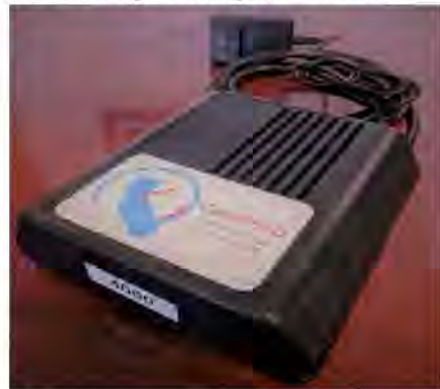
Figure 1: CalSPEED Home Measurement Device

The CalSPEED Home Measurement Devices are also being used to validate the speed and quality of services deployed by grantees pursuant to CASF Infrastructure grants and may also be used to validate the speed and quality of services deployed pursuant to federal infrastructure grants issued in California by the FCC, the Department of Agriculture and other such programs that may be created.