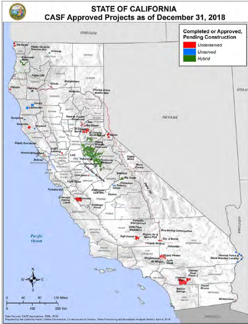
Map 2: Approved CASF Infrastructure Project in California