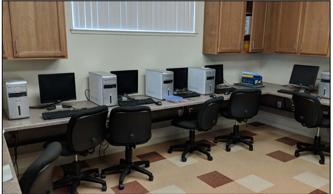
A computer lab at a publicly supported housing community in Hanford that was funded by a CASF grant.

Preference would be given to projects serving communities with a median household income at or below the California Alternate Rates