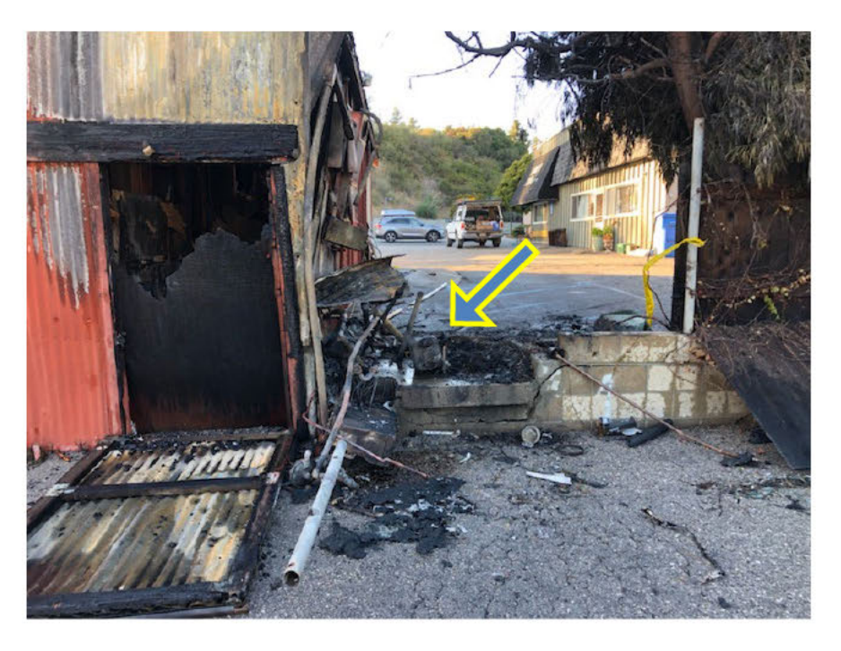
Looking from Museum Alley toward Main Street. Arrow to damaged MSA