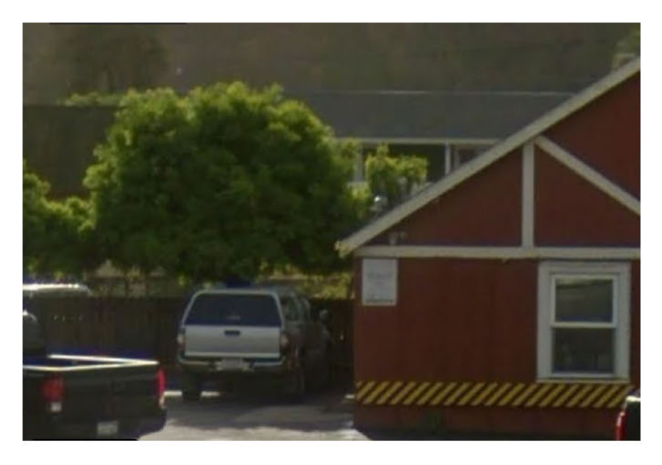
PRIOR TO FIRE – View from Main Street toward 'A Matter of Taste' parking lot