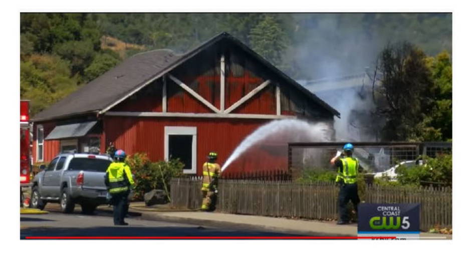
FIRE SUPPESSION August 01, 2020