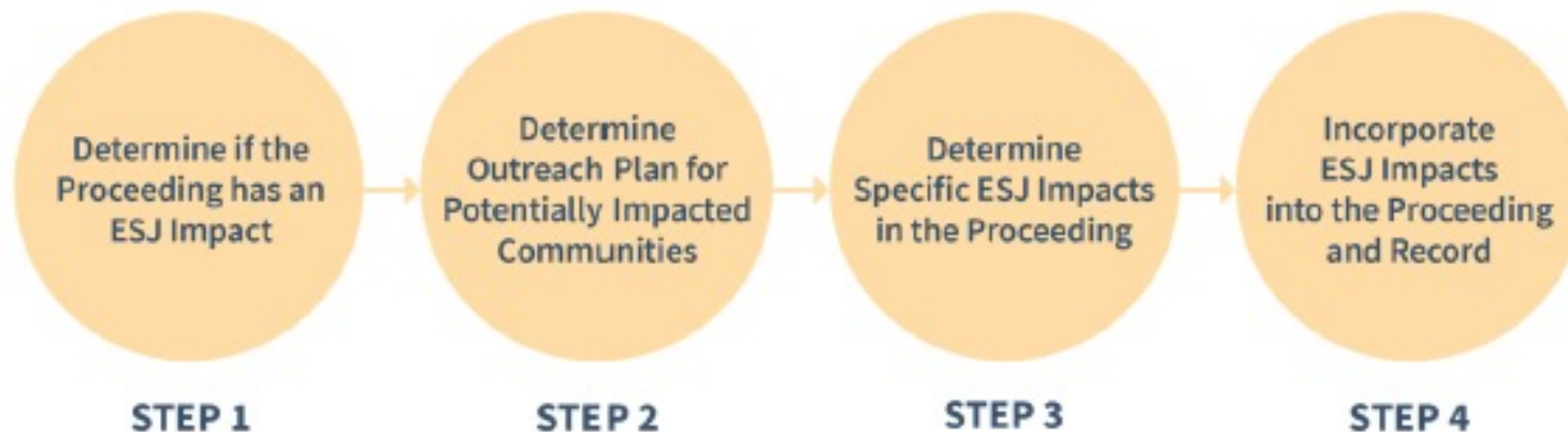
Figure 1: Steps for Incorporating ESJ Considerations into CPUC Proceedings