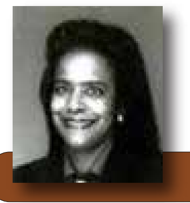
President GeM Communications Group