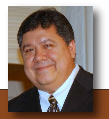
Chairman California Utilities Diversity Council