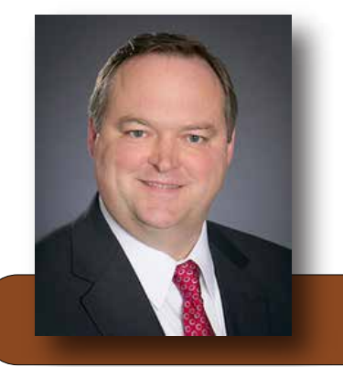
Commissioner California Public Utilities Commission