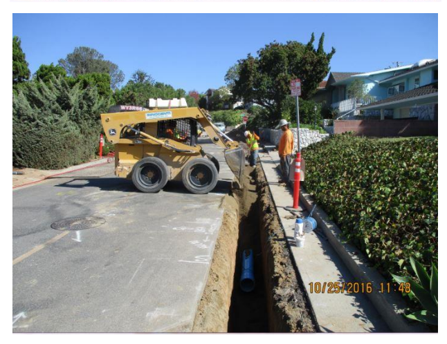
2016 Annual Report On the Utilization of Women, Minority, Disabled Veteran, Lesbian, Gay, Bisexual and Transgender Business Enterprises